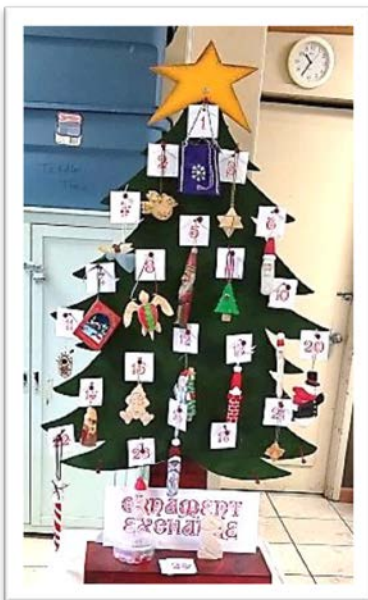
Ornament Exchange Tree

BILL KELLER – WOOD WORKER , Port Orchard WA Wood items for Rosemal art Phone: 360-871-0412 kellerbill@q.com