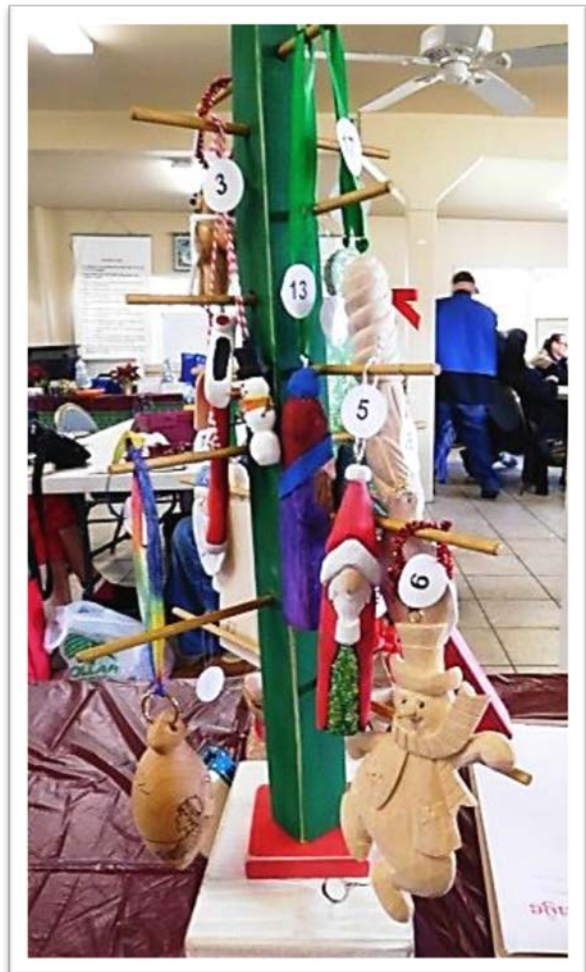
Ornament Exchange Tree